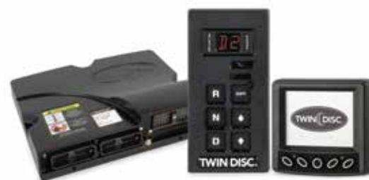
TDEC-501 ELECTRONIC CONTROL SYSTEM