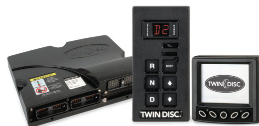
TDEC-501 ELECTRONIC CONTROL SYSTEM