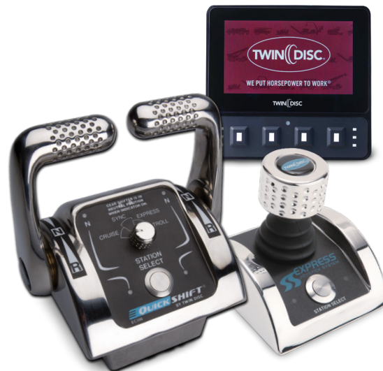
Joystick and display are optional equipment.